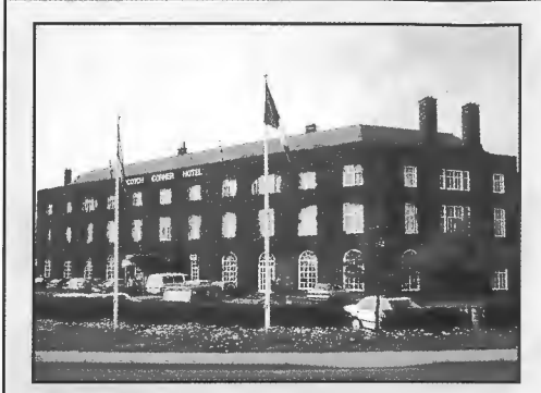
Quality Scotch Corner Hotel.

THE Lake District beckons for the Mid Mersey retired staff association. They are to visit Hawkshead - one of their favourite places.